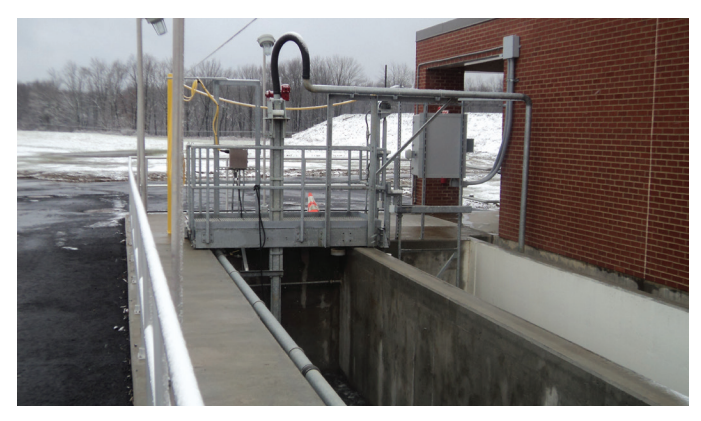
Bridges can be fitted with scrapers and/or pumps for grit removal.