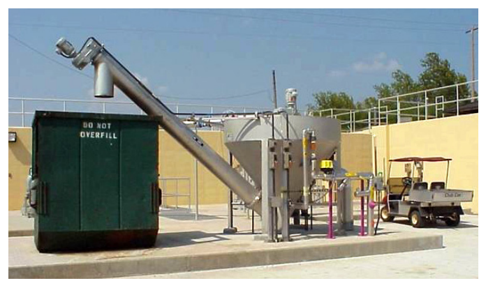
Grit Washer for exceptionally clean and dry grit.