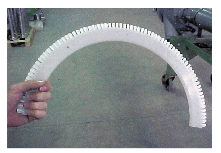
Easily Replaceable "Bolt On" Brushes