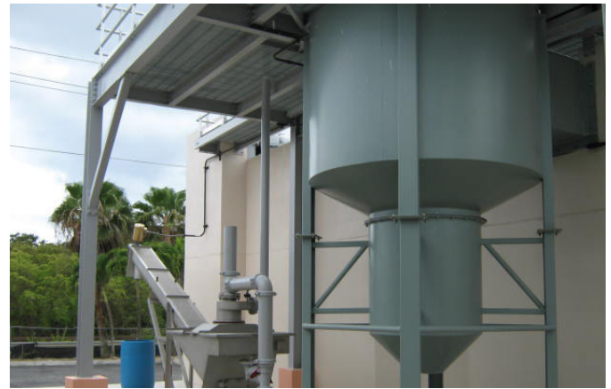
Optional steel tank design