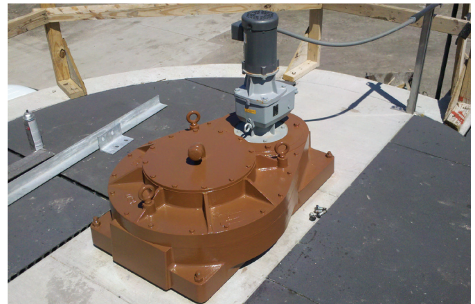
Submersible gear head