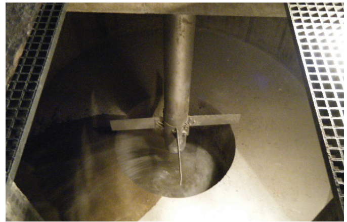
High efficiency X-impeller