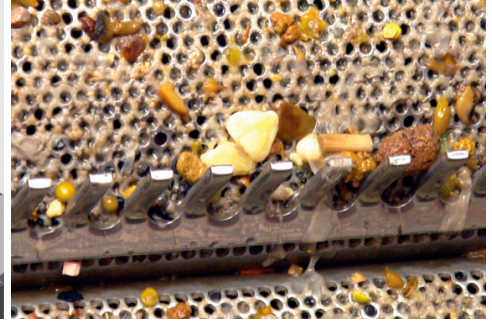
High capture rate including fats and debris.