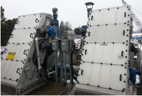
Completely enclosed for odor control and hygienic operation.